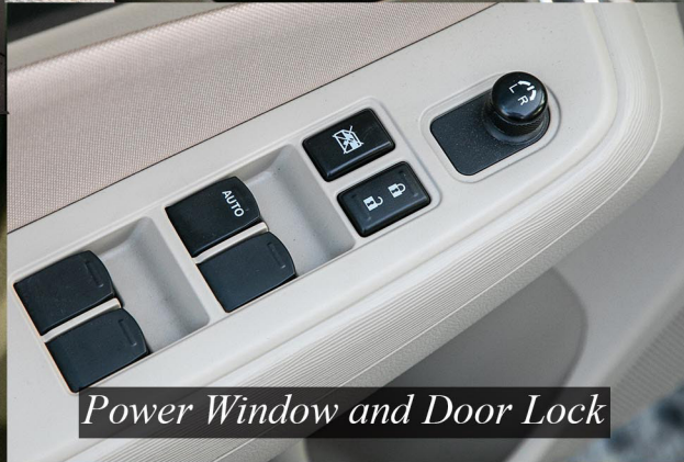
Power Window and Door Lock