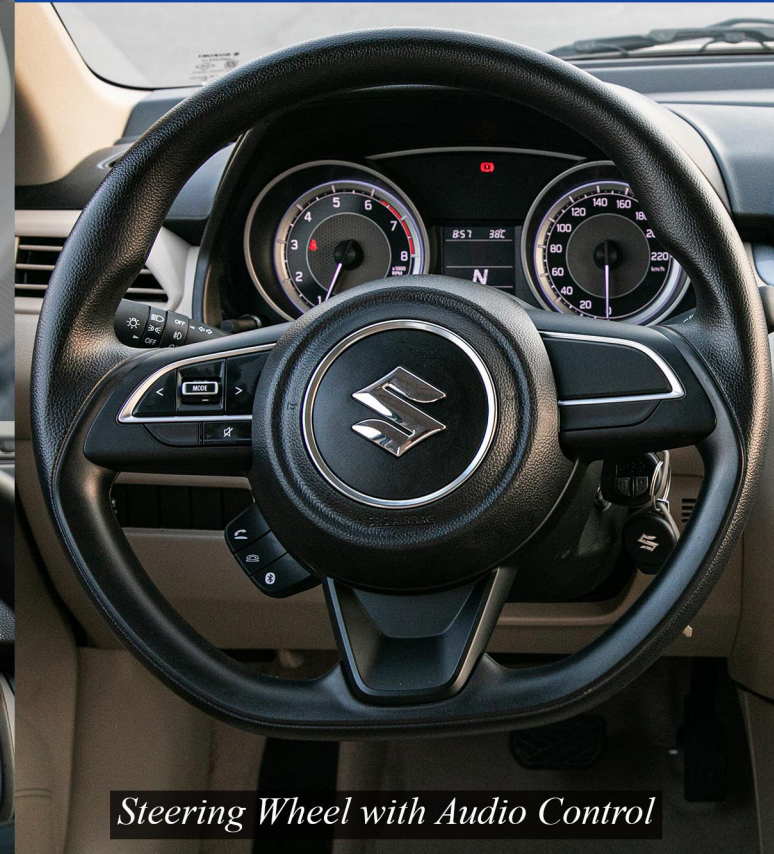
Steering Wheel with Audio Control