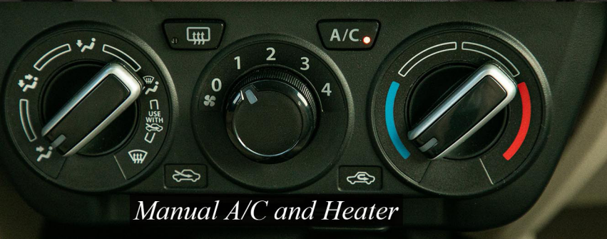
Manual A/C and Heater

The new Suzuki Dzire is an irresistible sedan. Its perfect proportions and exquisite style are eye-catching, and its spacious and comfortable interior makes for an incredible drive. Dzire gives you plush comfort in polygonal design, flowing seamlessly through its classic sedan styling. Touches of silver in its Smart interior tie its look together, giving you affordable luxury that gets attention. The spacious cabin frees up your movement while the ergonomically-placed controls allow you to enjoy every drive, in luxury.