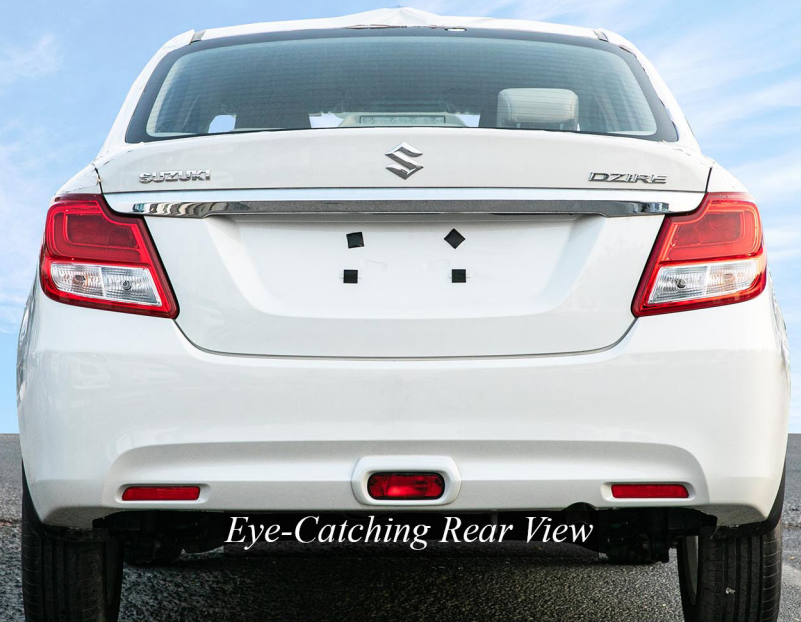
Eye-Catching Rear View