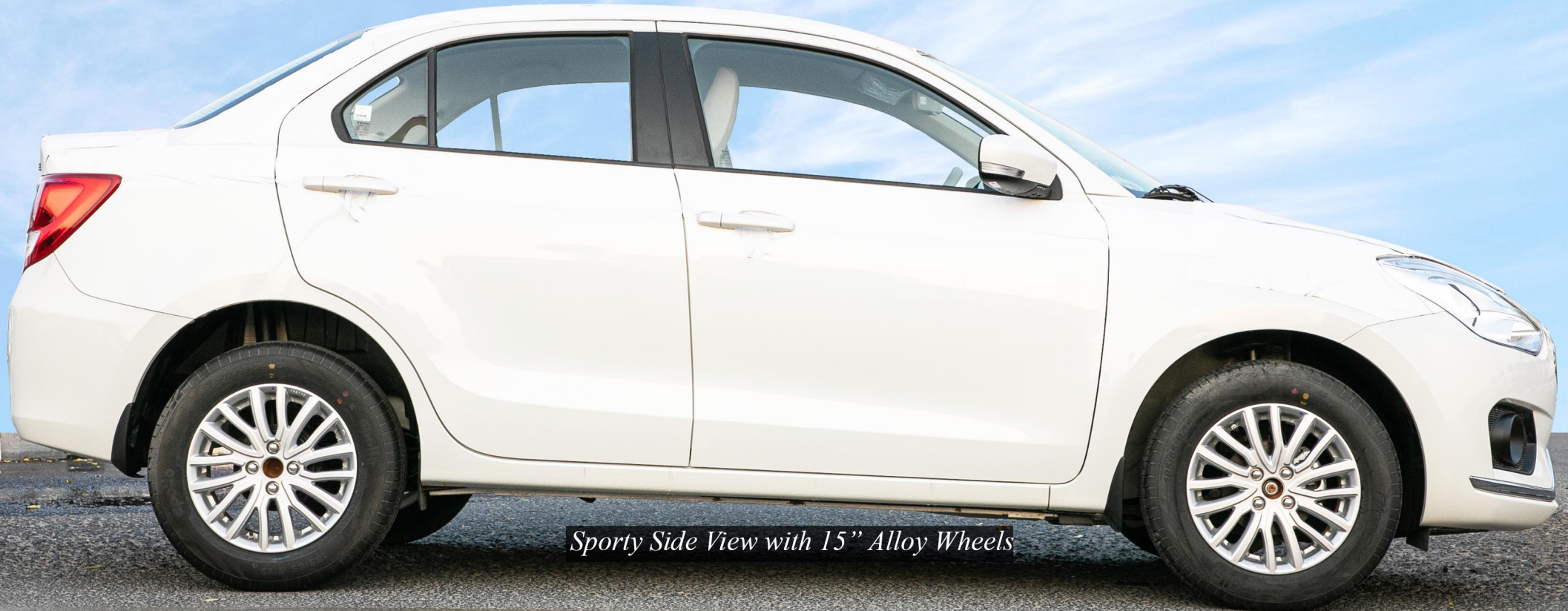
Sporty Side View with 15" Alloy Wheels