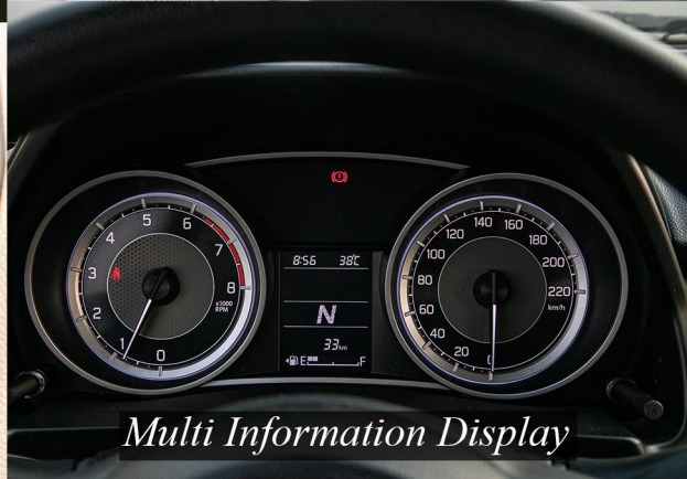
Multi Information Display