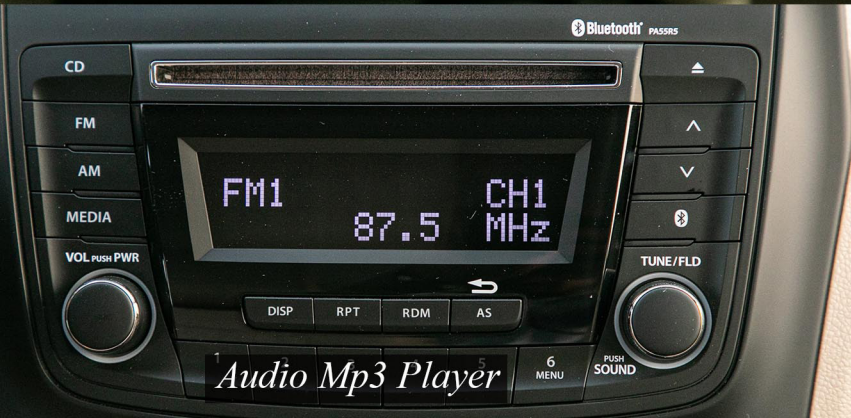
Audio Mp3 Player