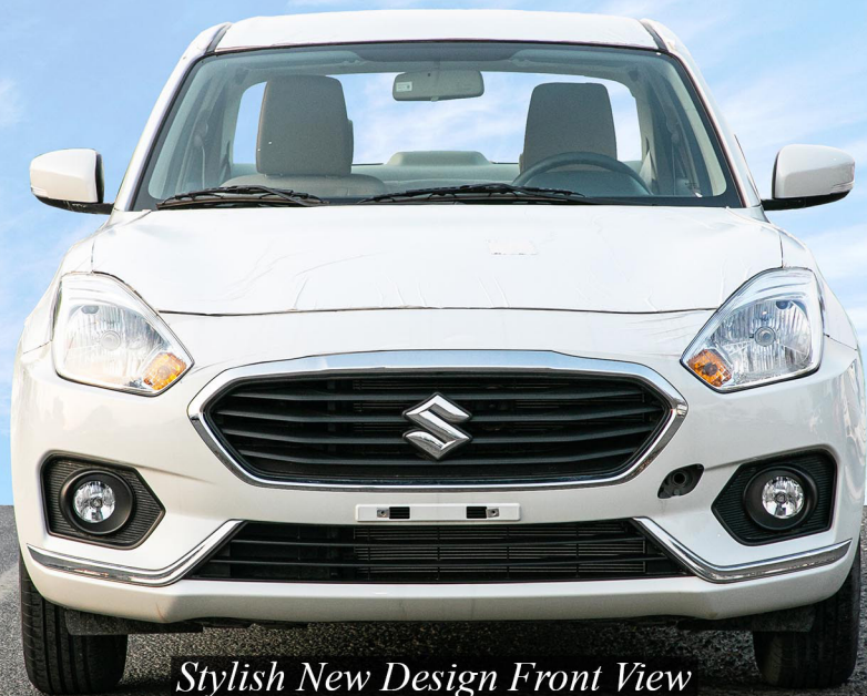
Stylish New Design Front View